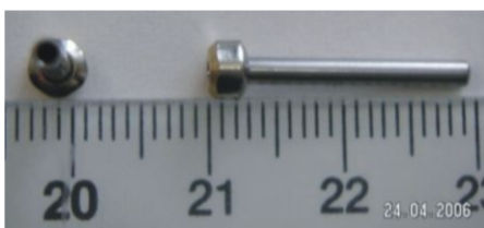
Figure 1 Metal tube to connect sensor

Measuring at frequency of 200 Hz at short milk tube, long milk tube, short pulsation tube mouthpiece of the liner. Near at hand hind quarter of the claw