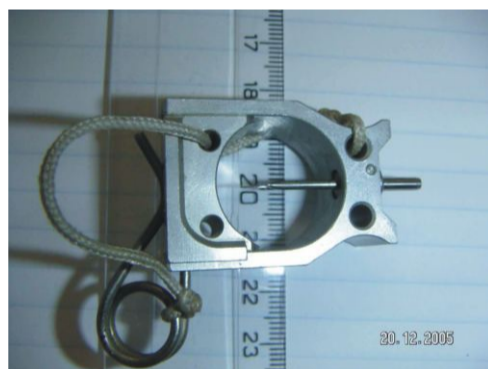
Figure 2 Connecting device between sensor and short milk tube (Sonden Bitec)

The sensor is connected to the tube through a short silicone hose. To measure the vacuum in the short milk tube a device that consists of two halves of a metal ring with a needle with a pointed end with a small hole is used (Figure). The hole of the needle points down to avoid flooding the sensor by milk.